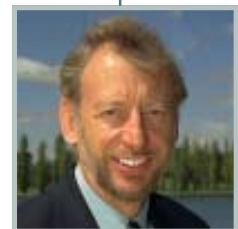
Federation Fellow Dick Manchester