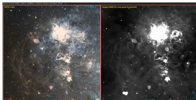
Comparison of LMC optical image from DSS observations (left) and the ASKAP continuum image (right) showing remarkable correspondence, with similar structures visible in both.

The LMC is a complicated field, containing many supernova remnants as well as 30 Doradus, the most active star-forming region in the local group. We have observed this field in spectral line mode to image its neutral hydrogen emission, but we also observed in continuum mode with 1 MHz channels to assist in the calibration of the spectral line data. The continuum image is itself spectacular and has now been released on CASDA. It can be found by searching for scheduling block 8532.