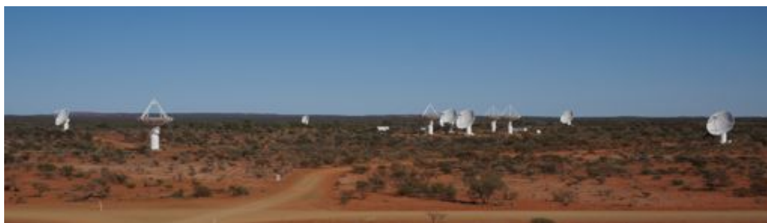
All six BETA antennas (pointed) are now fitted with Mk I phased array feeds.

The commissioning team has carried out extensive testing of BETA and resolved a number of minor issues with hardware and firmware. Although there is still a significant amount of work to do, the commissioning team is now working towards stabilising the system and making the first images with BETA.