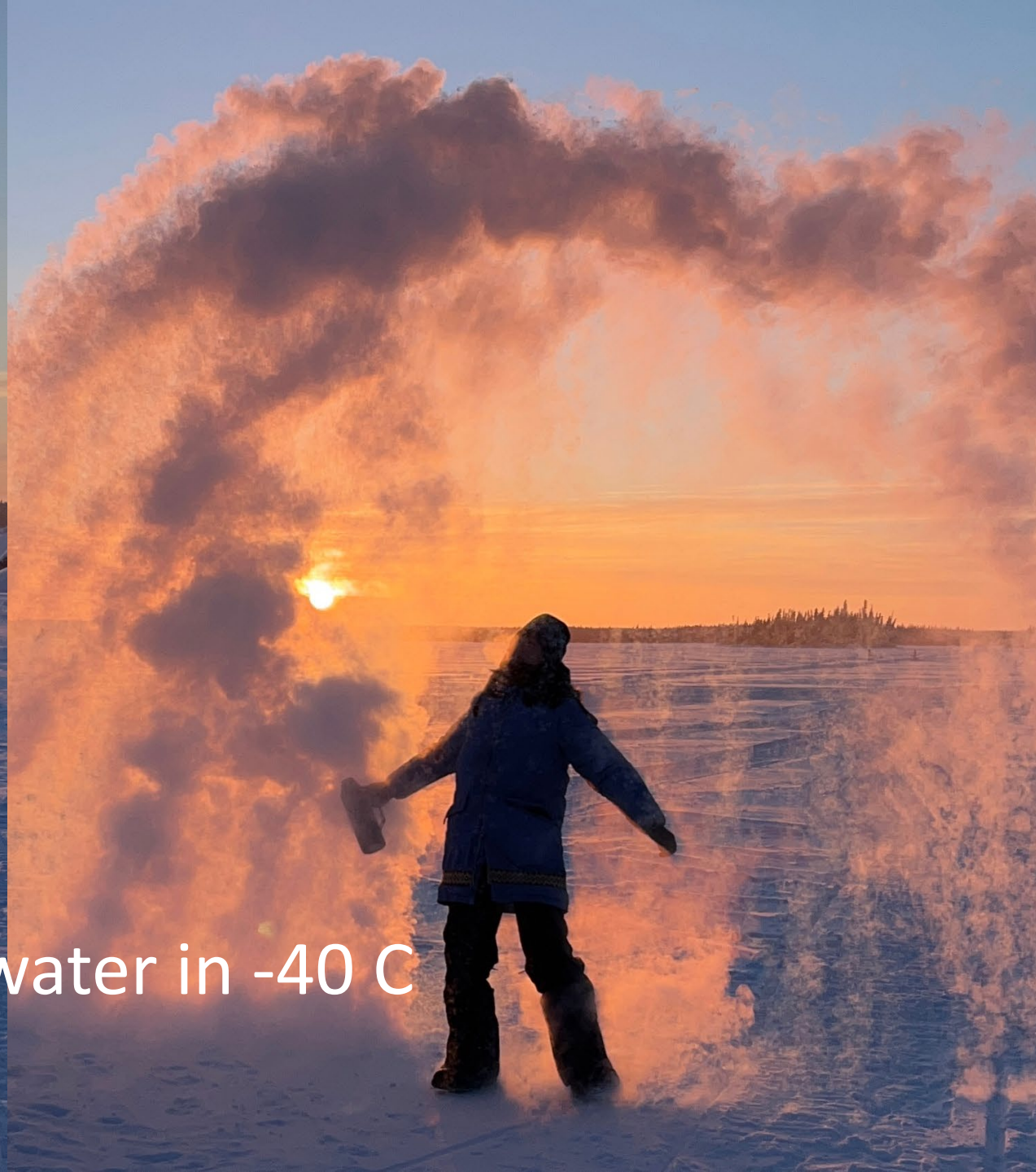
3 Boiling water in -40 C